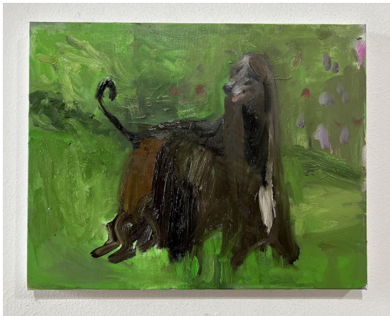
Afghan Hound Oil on canvas 11" x 14" 2023 $1400