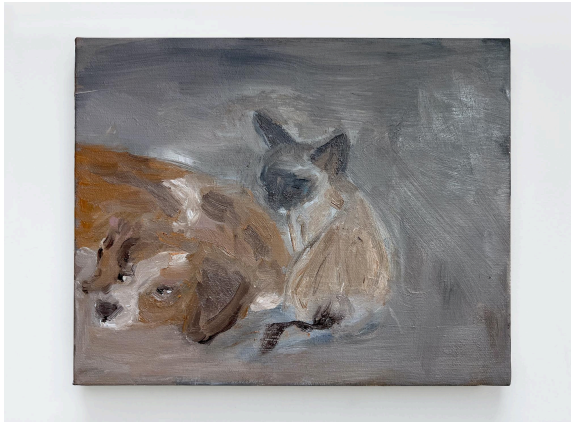
Friends Oil on canvas 8" x 10" 2023 $950