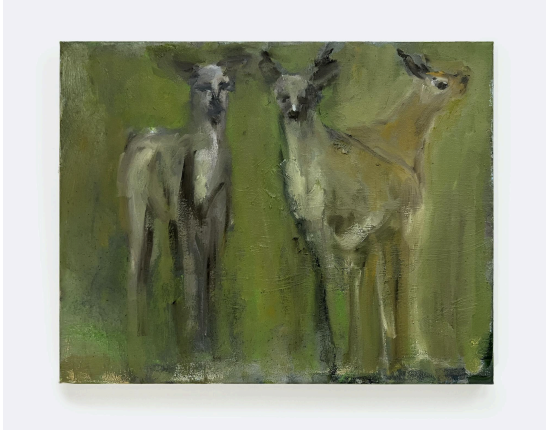
Three Deer Oil on canvas 11" x 14" 2023 $1400