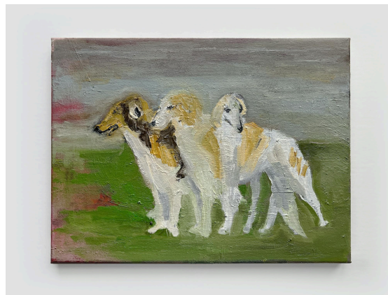
Three Hounds Oil on canvas 9" x 12" 2023 $1200