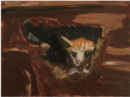
Cat in Wall Oil on canvas 9" x 12" 2021 $1200