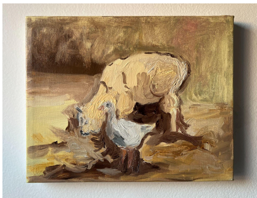
Alpaca and Goose Oil on canvas 8" x 10" 2024 $950