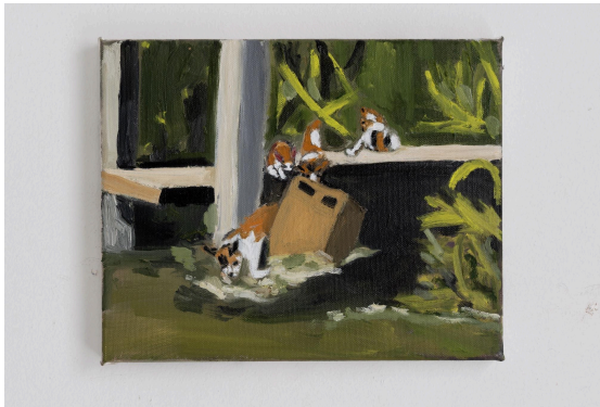
Kittens on the Dock Oil on canvas 8" x 10" 2021 $950