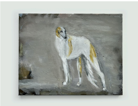
Borzoi Oil on canvas 11" x 14" 2023 $1400