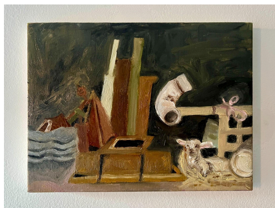
Little Lamb Oil on canvas 9" x 12" 2024 NFS