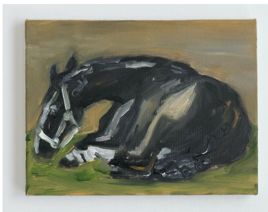
Black Horse Oil on canvas 9" x 12" 2021 $1200