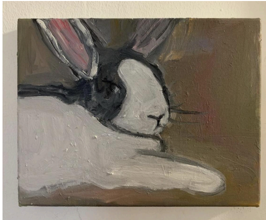
Bunny Oil on canvas 9" x 12" 2022 $1200